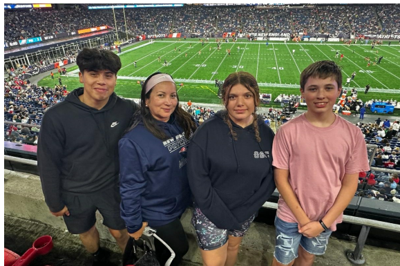
Several Club members were recently at Gillette Stadium rooting on the New England Patriots!