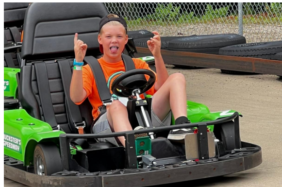
Tween and Teen campers enjoyed go-karts, climbing walls, batting cages, bumper boats and more at Chuckster's!