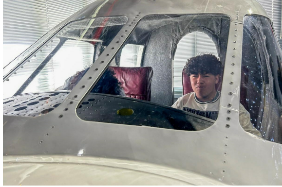
Members of our Stahl Teen Center explored the Aviation Museum of New Hampshire!