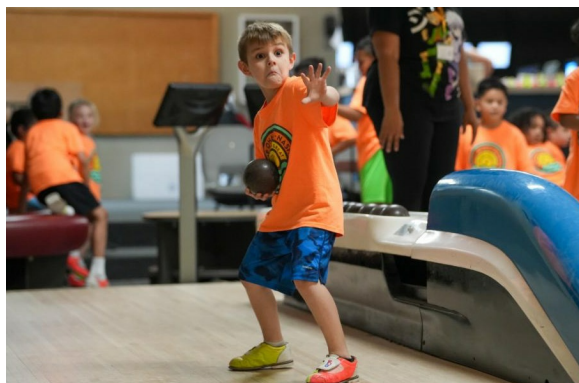
ELC campers were on a roll this summer at Leda Lanes and Roller Kingdom!